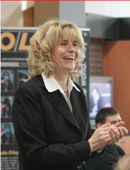
Founder and CEO of Clear Cut